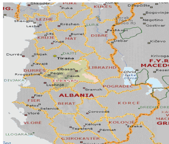
Figure 1. Map of Albania