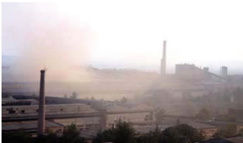
Figure 5. Metallurgical Plant (completed)