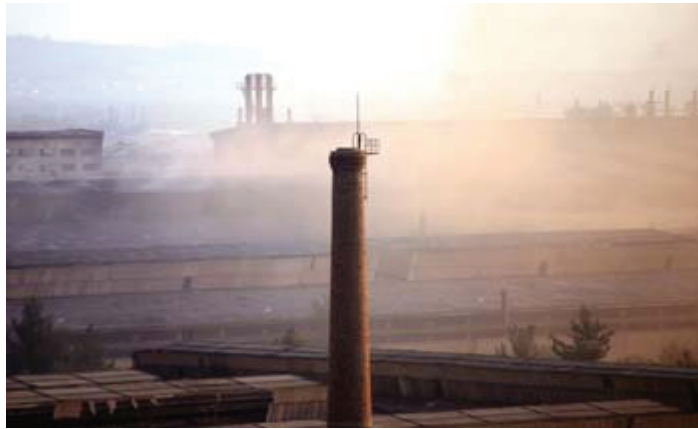
Figure 4. Metallurgical Plant in Elbasan (incomplete)

Actually it did end up in 1962 but it could not function in its full potential by 1962, due to the political split with the Soviet Union.